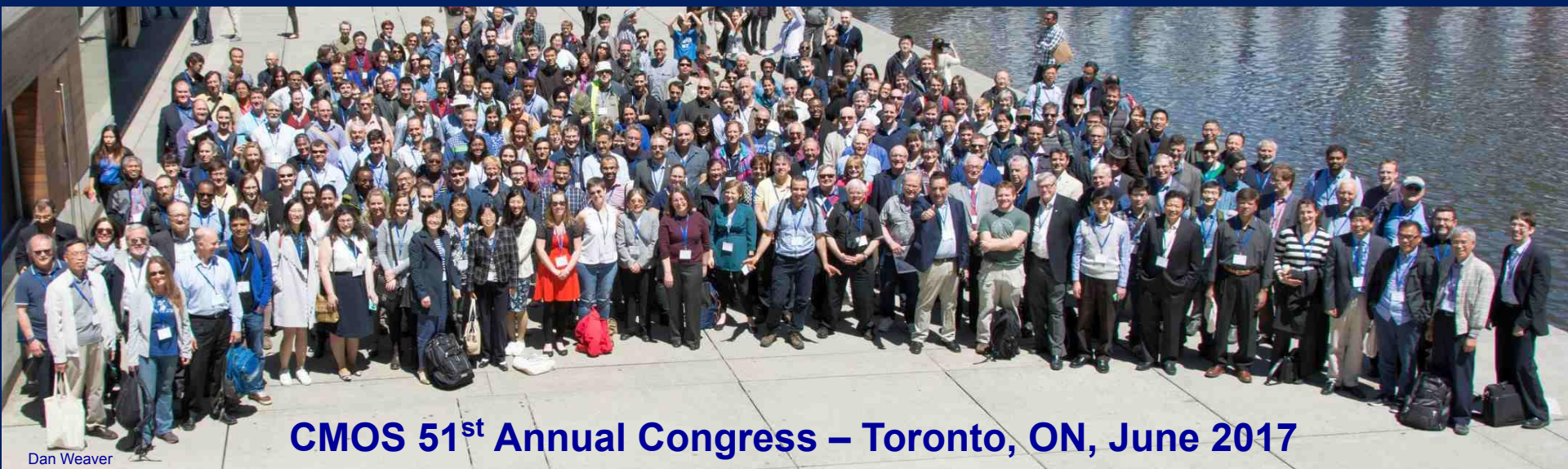
CMOS 51 st Annual Congress – Toronto, ON, June 2017